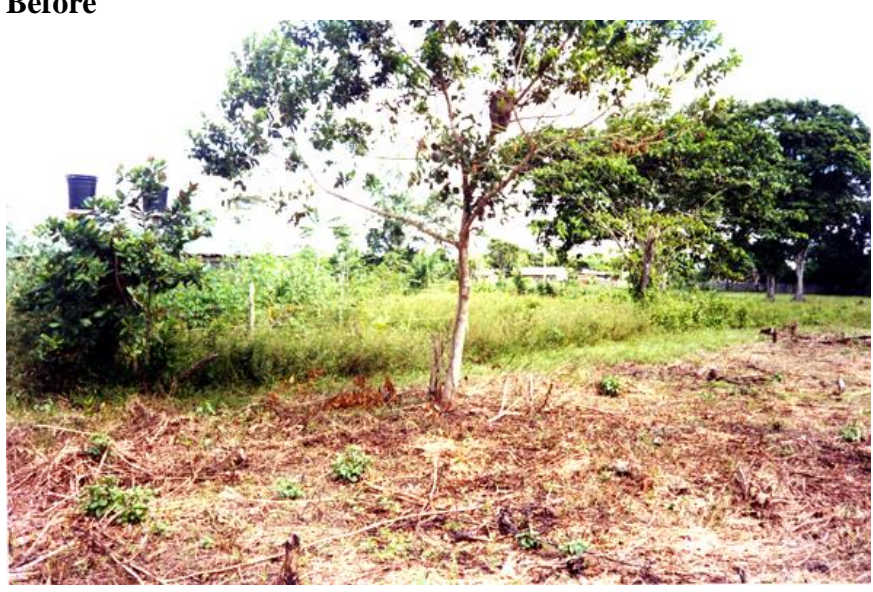
Photographs 1, 2 and 3 Experimental Plot ( Chagra ) before and after planting Before

spp), aji (Capsicum spp), plátano (Musa spp), rice (Oryza spp) dormidera (Mimosa spp), guamo (Inga spp). The dormidera and Guamo are nitrogen-fixing plants that improve soil quality.